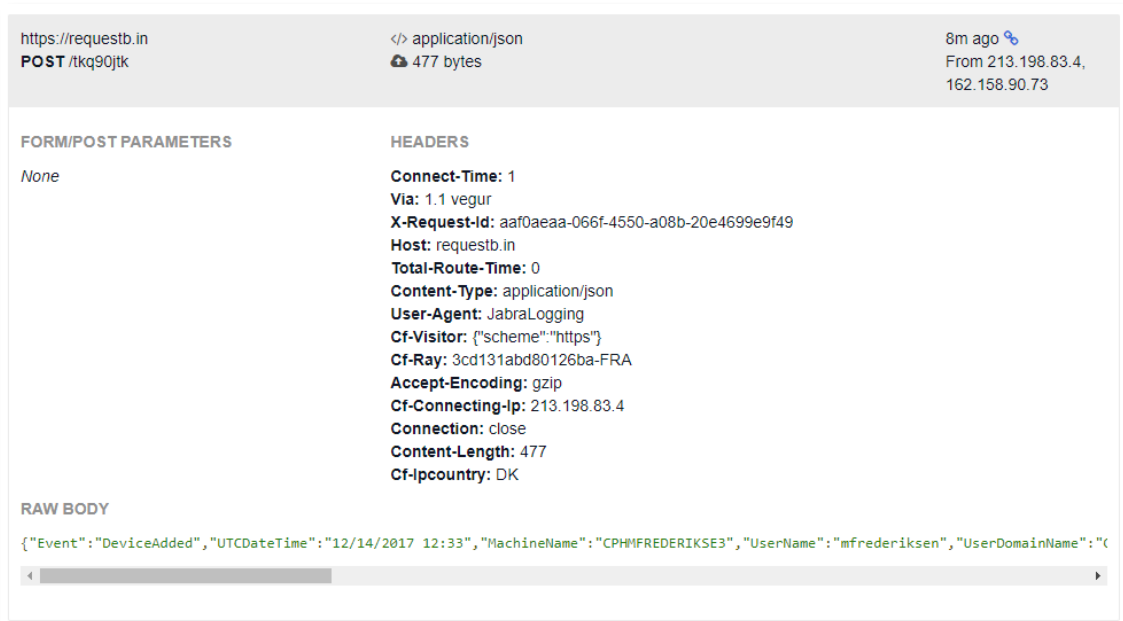
Figure 2 Reporting data example

An example of reporting data is shown below: